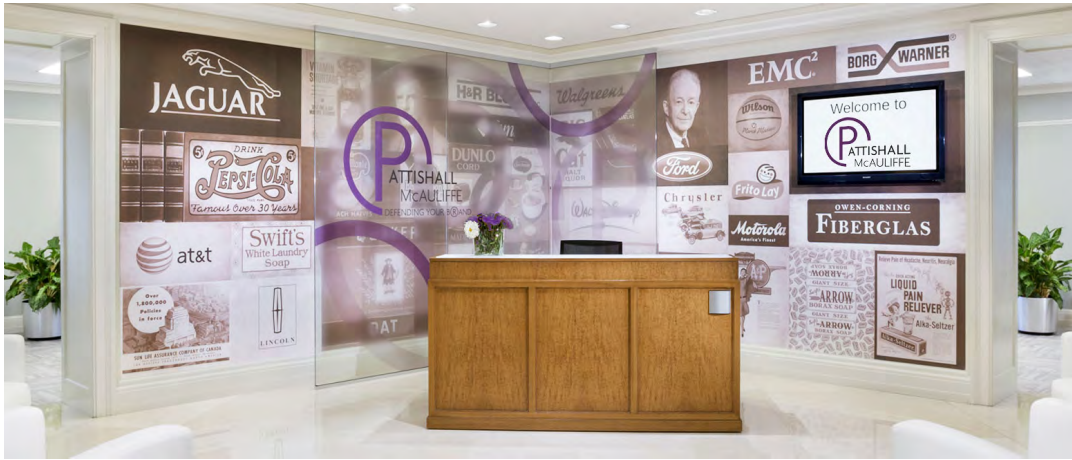
Pattishall, McAuliffe, Newbury, Hilliard & Geraldson LLP's reception area offers visitors a glimpse of the firm's past, present, and future.