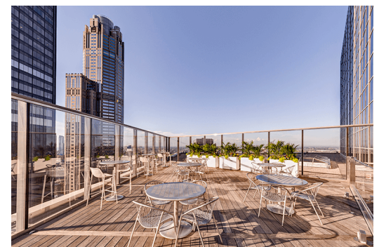
200 South Wacker's Rooftop Deck

Amenities will reopen for tenant use as soon as it is feasible to do so. We appreciate your patience and understanding.